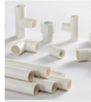
PVC Rigid Conduit