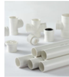
PVC Drainage System