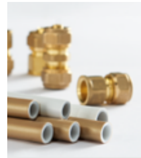
A/C Piping System