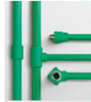
PP-R Plumbing System