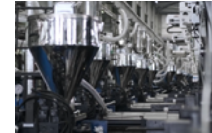
Injection machines with infrared heating rings