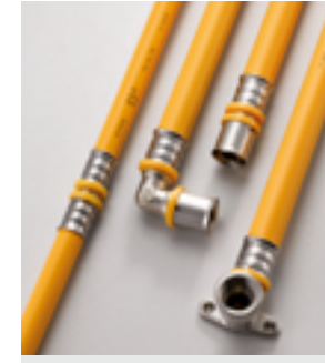
Gas Piping System