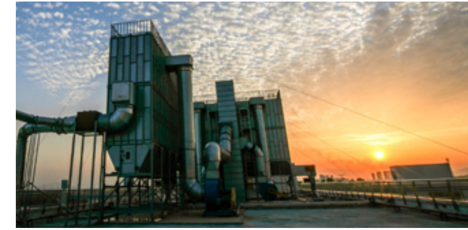
Exhaust gas purification equipment

We treat our customers with respect and take every opportunity to listen attentively to feedback.