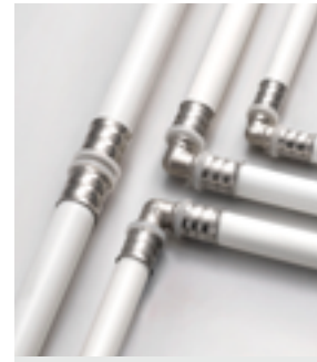
Multilayer Plumbing System